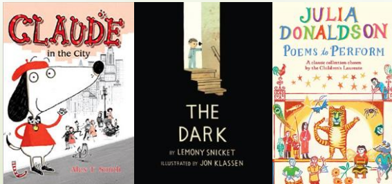
Claude In The City In The Dark Julia Donaldson